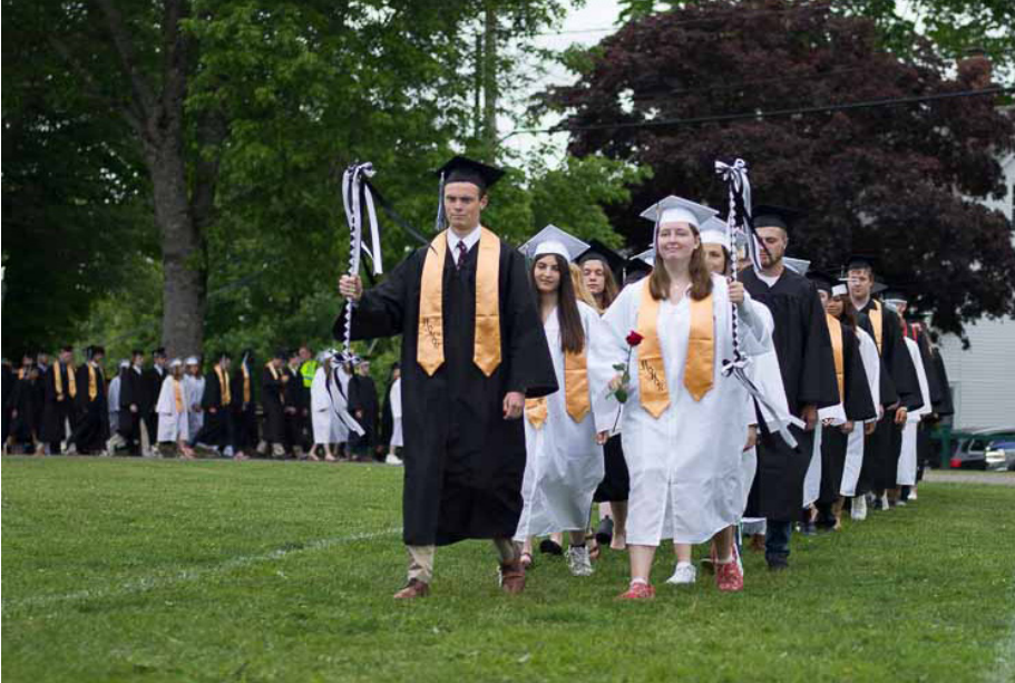
The Class of 2022 Marched in to graduation before the rain started on Friday, June 3.