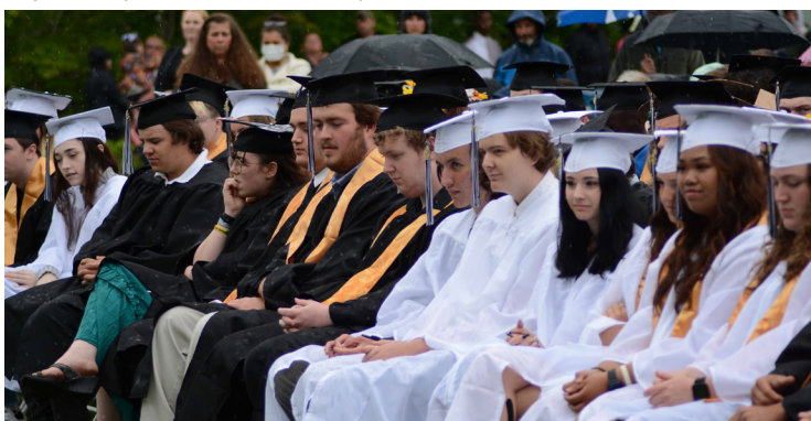
"It turns out those silly hats actually make great rain protection," one graduate was heard to remark.