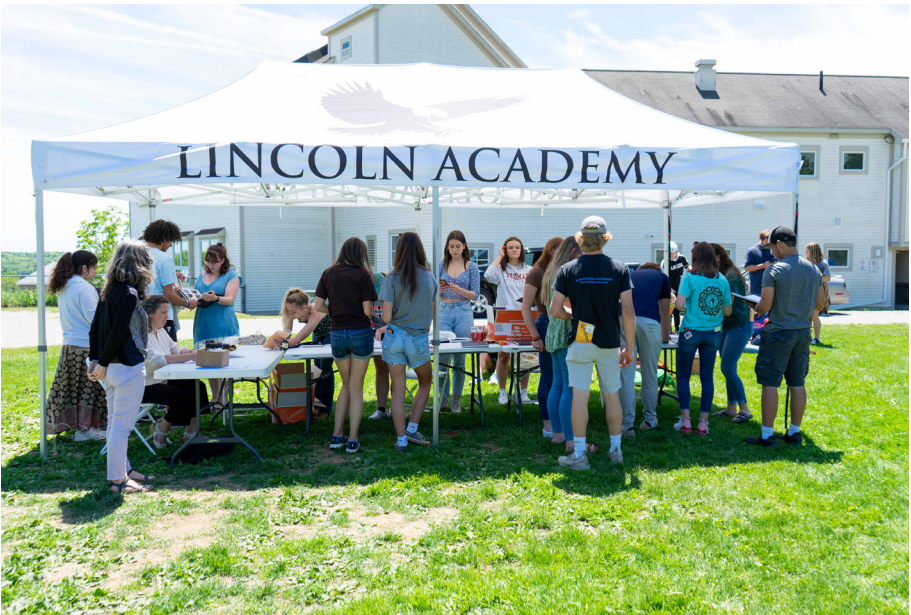
On Wednesday, June 1 seniors had a picnic lunch on the Track Field and got their yearbooks, which they had a chance to share and sign. Every member of the senior class got a copy of the 2022 Lincolnian Yearbook.