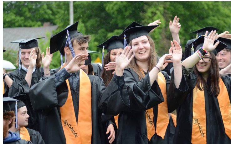
Classmates wave their hands in the air to celebrate the day, even as visible raindrops soaked everyone present.