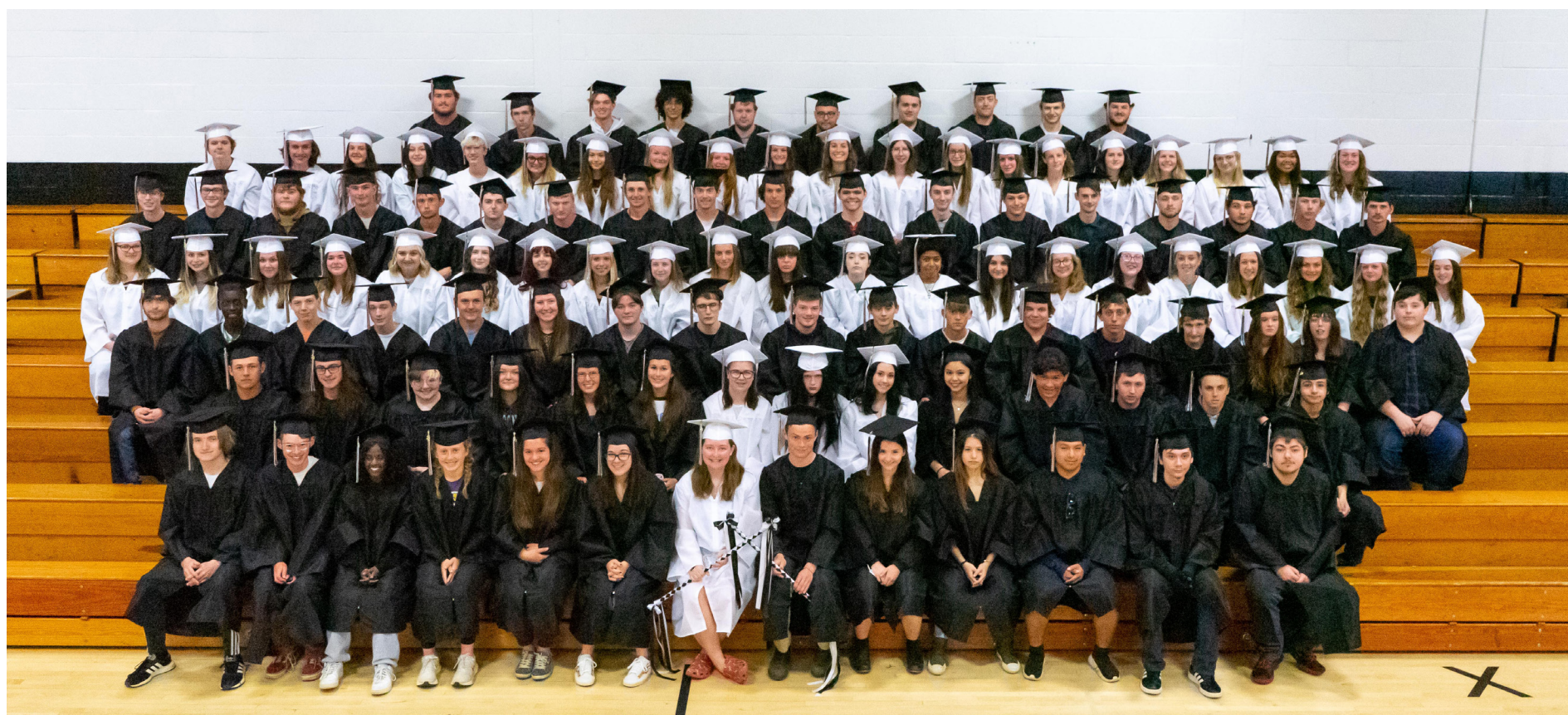
Class of 2022 poses for the first in-person class photo since 2019.

LA Class of 2022 brings Commencement back to campus in a rainy graduation ceremony